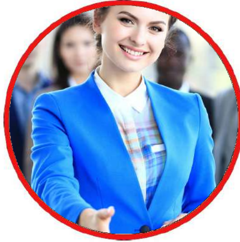
Meet business -women in Moscow