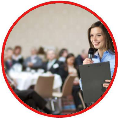
You will take part in the conference