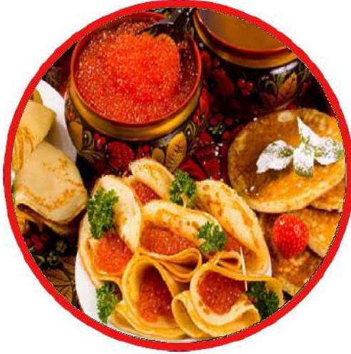
Try Russian cuisine