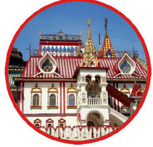
Visit museums and exhibitions