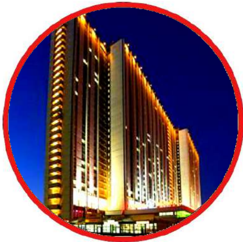
You will live in an excellent hotel "Izmailovo"