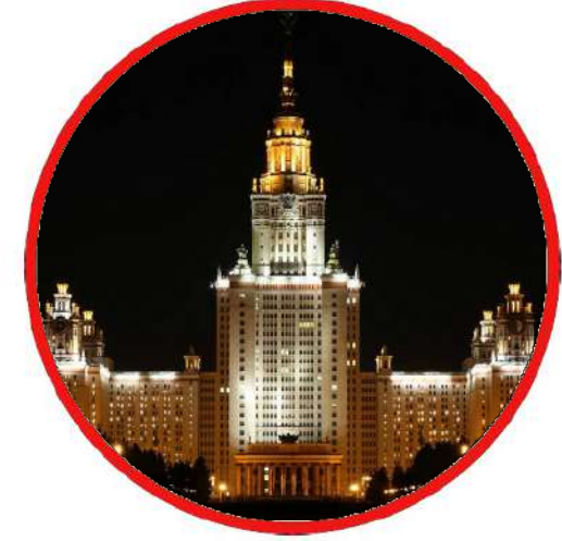
See interesting places in Moscow